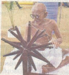
TEXTILE INDIA 2017

Addressing the media, Irani said that this was the era of the development of the textile industry. She affirmed the commitment of the Government of India to promote the sector. She also said that many Union ministers would attend Textiles India tomorrow, on the 3rd and final day, on Sunday.