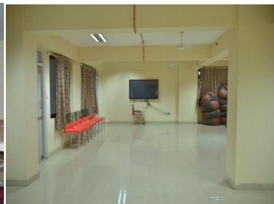
SEWING MACHINES AND RECREATION HALL