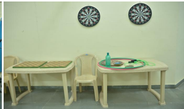
GYMNASIUM AND INDOOR GAMES AREA