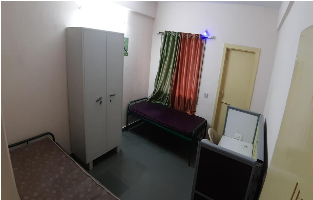
Non AC Twin-Sharing Room