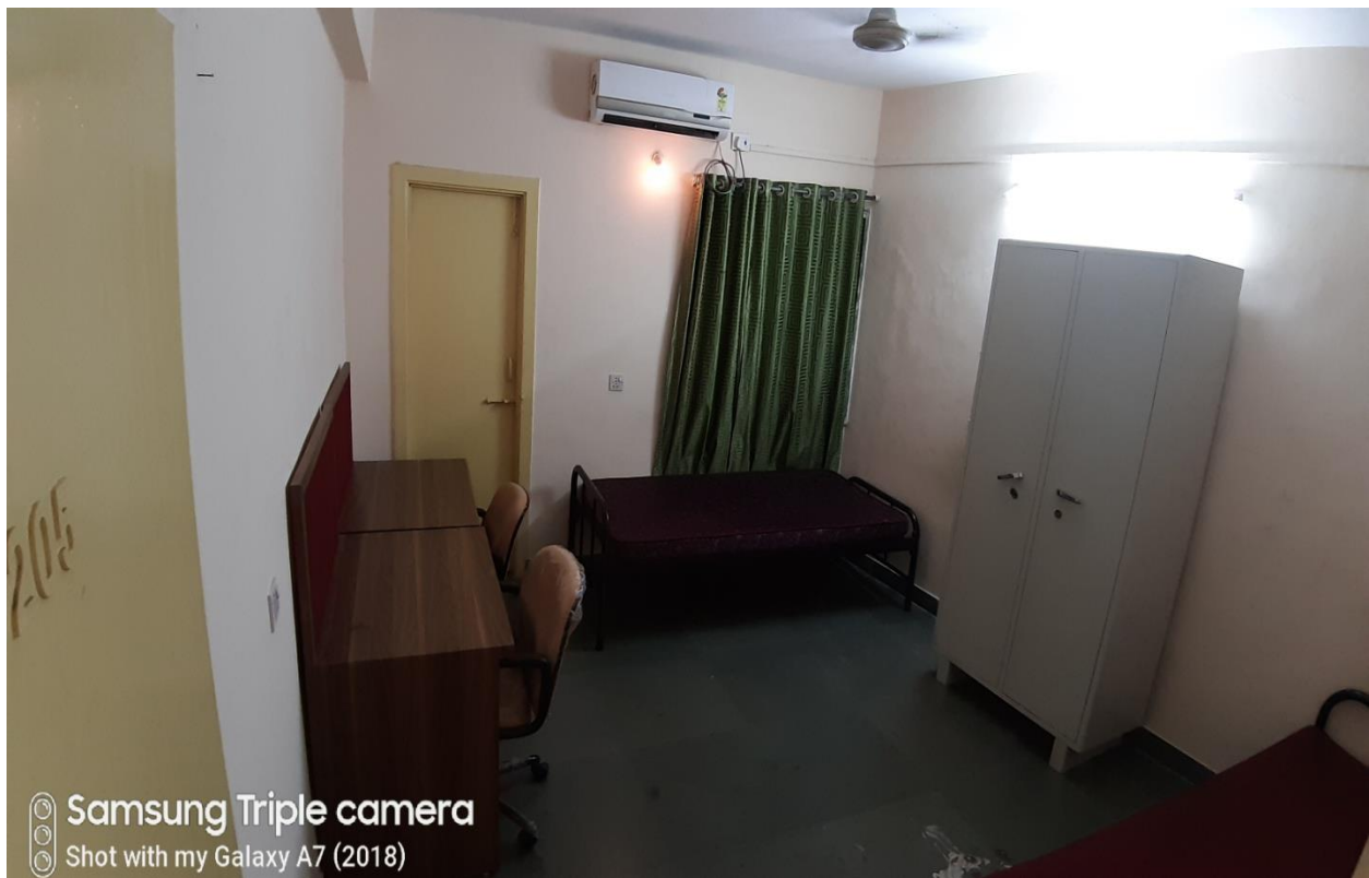
AC Twin-Sharing Room