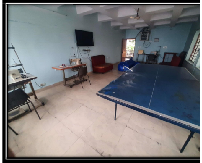
SEWING MACHINES & COMMON ROOM