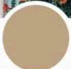
ROSEWATER 11-1408 TPG