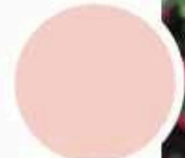
PALE DOGWOOD 17-2034 TPG

Inspired from wintery florals, the theme elaborates bold floral motif prints all over the garments. These chunky flowers gives exotic wintery effect with incorporation of bright colours. These designs brings a combination of freshness with a sense of playfulness. Images of twigs, dried branches and lovely foliage can be translated to a trendy dash of creativity with the right color combination. These exquisite seasonal trendy prints could shape the winter collection by provide lovely visual contrast in the form of smaller accent additions.