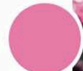
AURORA PINK 15-2270 TPG