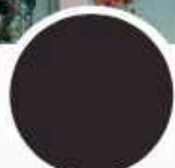
BURNT HENNA 19-5431 TPG