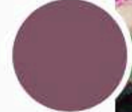
YARROW 17-2034 TPG