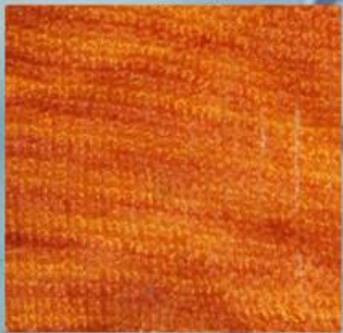
2 ply acrylic yarn knits on 7 gauge