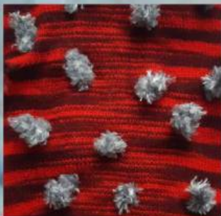
2 ply acrylic yarn and furr yarn made on 12 gauge and hand done