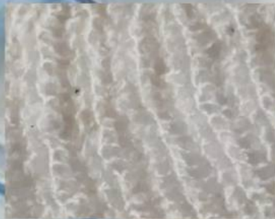
1 ply acrylic fancy yarn and knits on 2.5 gauge