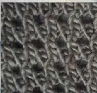
chunky thick yarn loop transfer on 2.5 gauge