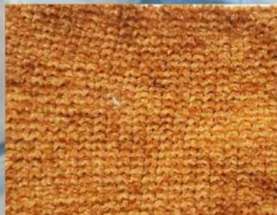
3 ply velvet yarn knit on 5 gauge