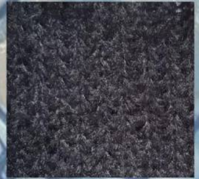
3 ply acrylic fancy yarn knits on 2.5 gauge