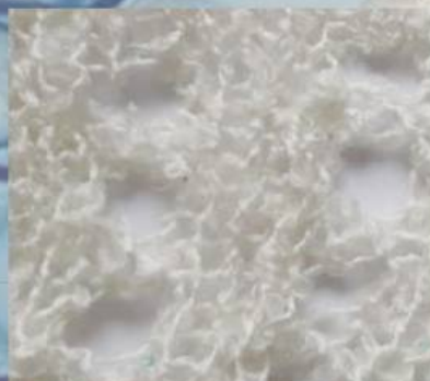
1 ply acrylic fancy yarn loop transfer on 2.5 gauge