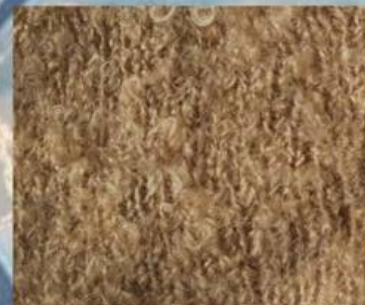
polyster hairy fancy yarn knit on 5 gauge.