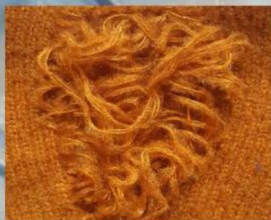
4 ply acrylic fancy yarn ladder effect knits on 5 gauge