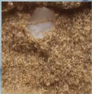
polyester hairy fancy yarn loop drop and entangled knits on 5 gauge