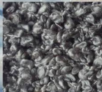
bubble fancy yarn hand knitted with 9 no. needle