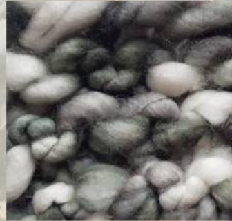
thick bulky shaded yarn hand knitted with 11 no. needle