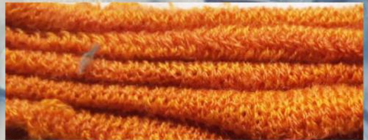
2 ply acrylic yarn made on 7 gauge and 3D emboss effect hand done