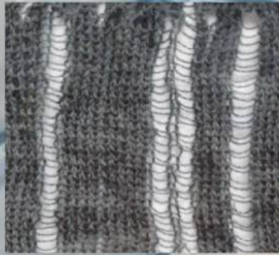
2 ply acrylic yarn ladder effect knits on 7 gauge