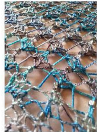
Cobweb pattern by Boo Knits