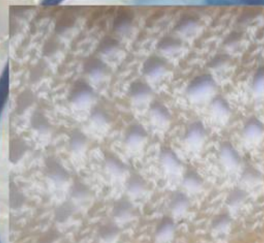
3 ply acrylic yarn loop transfer on 5 gauge