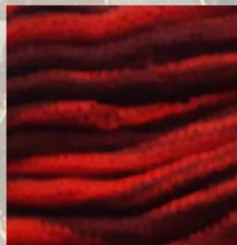
2 ply acrylic shaded yarn made on 12 gauge and 3D emboss effect hand done