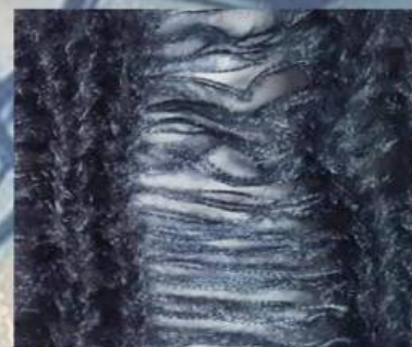
4 ply acrylic fancy yarn ladder effect knits on 2.5 gauge