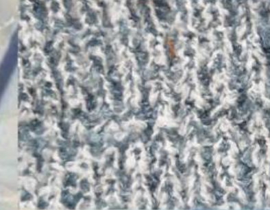
2 ply acrylic fancy yarn mixed together knits on 2.5 gauge