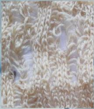
3 ply acrylic yarn and golden lurex yarn ladder effect and loop transfer knits on 7 gauge