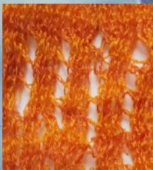
2 ply acrylic shaded yarn loop transfer on 5 gauge