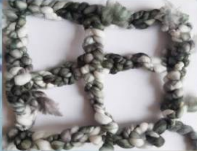
thick bulky shaded yarn knitted by hand with fingers