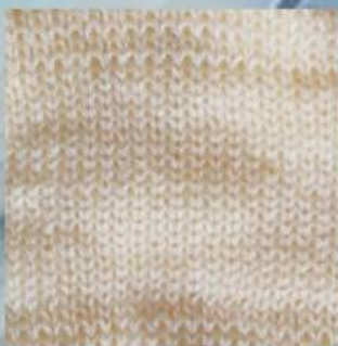
3 ply acrylic yarn knits on 7 gauge