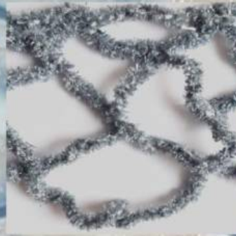
furr fancy yarn knitted with crossia